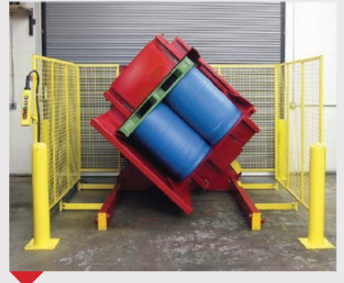
QUICKLY INVERT DRUMS TO MIX CONTENTS, PROHIBIT MOLD GROWTH, OR TRANSFER TO IN-HOUSE PALLETS

GROUND LEVEL LOADING WITH A MANUAL OR ELECTRIC-POWERED PALLET JACK