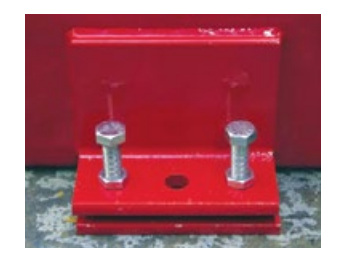
LEVELING JACK PLATES: Levels floor plate on uneven flooring