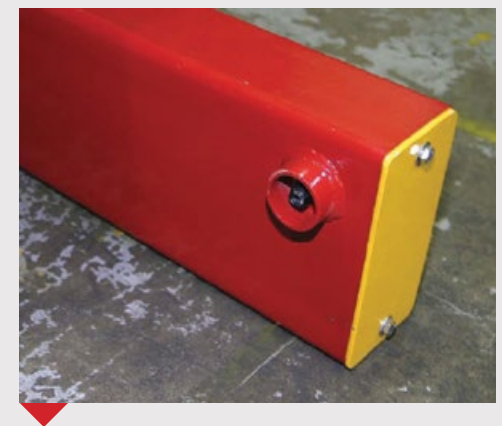
FOOT SWITCH PROTECTS FEET FROM PINCH POINT WHEN LOADING PLATE TRAVELS FLUSH TO THE FLOOR