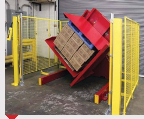
DUAL PLATES TRAVEL IN UNISON; NEAR-PERFECT CENTER BALANCE PROVIDES SMOOTH INVERSION OF TALL OR SHORT PARTIAL LOADS