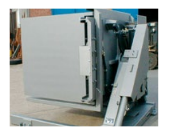
CUSTOM PAINT FINISHES: Stainless steel, food-grade Steel-It, and custom color match paint