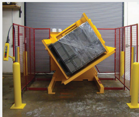
EASILY TRANSFER TOTES OR ANY OTHER REUSABLE PACKAGING FROM WOOD TO PLASTIC