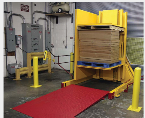
EASILY TRANSFER CORRUGATE FROM A WOOD PALLET TO A PLASTIC PALLET