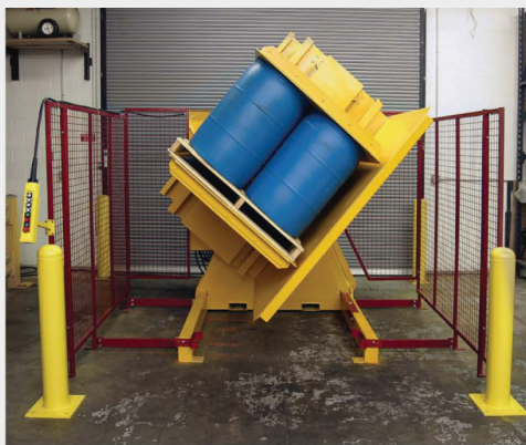
EASILY TRANSFER DRUMS FROM ONE PALLET TO ANOTHER