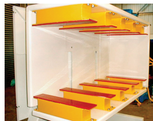
STAND OFFS: Allow for pallet-less loading and unloading