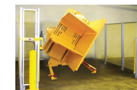
BOSCH GUARDING: Guarding which bolts directly to the floor with removable panels for maintenance access