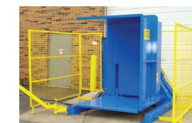
HIGH STYLE GUARDING: Provides additional protection for forklift operators (mounted directly to the machine)