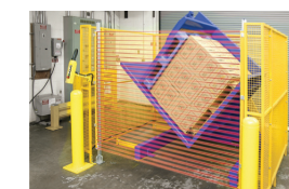
LIGHT CURTAINS: Provides a soft guarding across the front of the machine for additional protection