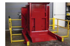
STANDARD MACHINE GUARDING: Provides protection from forklifts