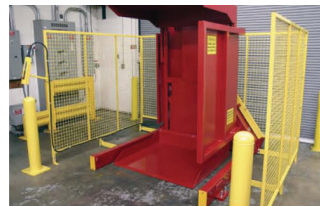
HIGH STYLE GUARDING: Provides additional protection for forklift operators (mounted directly to the machine)