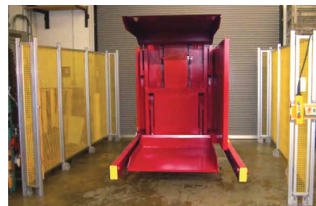
BOSCH GUARDING: Guarding which bolts directly to the floor with removable panels for maintenance access