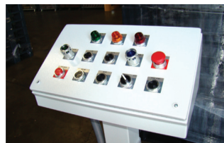
CONSOLE: Angle-top control with pedestal