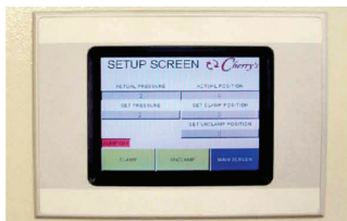
HMI OPERATOR INTERFACE: Offers multiple screens for maintenance and pressure settings