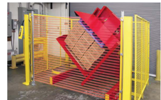
LIGHT CURTAINS: Provides a soft guarding across the front of the machine for additional protection