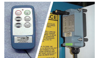
WIRELESS REMOTE: Receiver mounts to machine