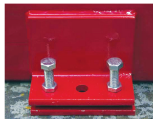
LEVELING JACK PLATES: Levels floor plate on uneven flooring