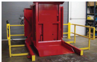
STANDARD MACHINE GUARDING: Provides protection from forklifts