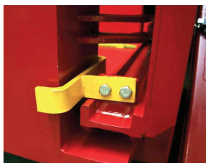
LOCK OUT BAR: Prevents plates from moving when maintenance is required