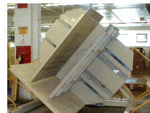
CUSTOM-SIZED TABLE: Larger and smaller platforms available for custom-sized loads