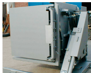
CUSTOM PAINT FINISHES: Stainless steel, food-grade Steel-It, and custom color match paint