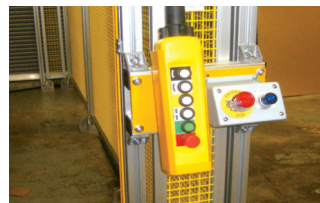
PUSH BUTTON: For safe and easy operation (standard)