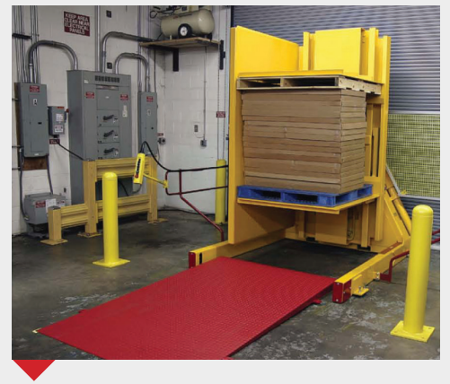
EASILY TRANSFER CORRUGATE FROM A WOOD PALLET TO A PLASTIC PALLET