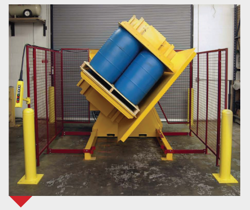
EASILY TRANSFER DRUMS FROM ONE PALLET TO ANOTHER