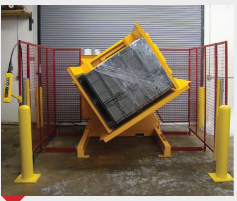
EASILY TRANSFER TOTES OR ANY OTHER REUSABLE PACKAGING FROM WOOD TO PLASTIC