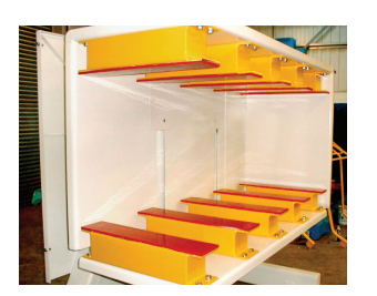
STAND OFFS: Allow for pallet-less loading and unloading