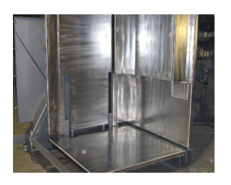
CUSTOM PAINT FINISHES: Stainless Steel, food-grade Steel-It, and custom color match paint