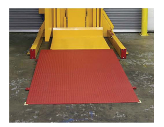
LOADING RAMP: Heavy-duty reinforced ramp which allows for manual and electric pallet truck entry