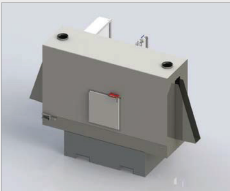
Stage 1 Washer: Spray Only Model #: PPW-C24-SZ3

Base model includes spray module with heated water. Detergent can be added with this module.